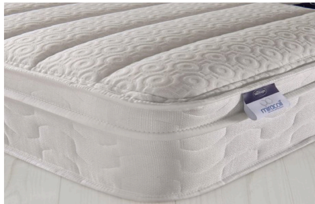
'MOCK' BOX TOP - QUILTED