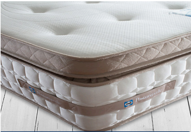
BOX TOP - TUFTED