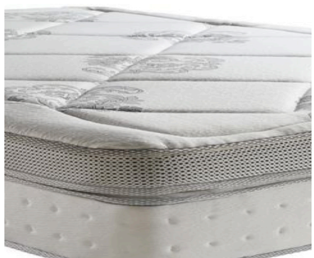
BOX TOP - QUILTED