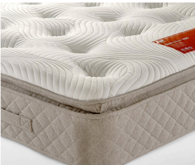
PILLOW TOP - TUFTED