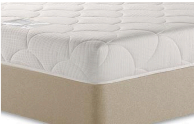
QUILTED WITH TAPE EDGE AT BOTTOM AND PLAIN FABRIC UNDERSIDE - SITS FLAT ON BASE