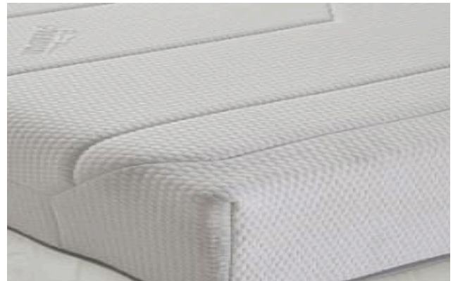
QUILTED STRETCH FABRIC WITH ZIP (OFTEN ON UNDERSIDE) WITH PLAIN FABRIC UNDERSIDE. SITS FLAT ON BASE