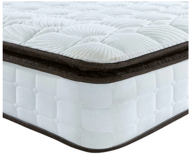
PILLOW TOP - QUILTED