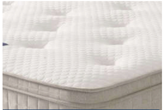
'MOCK' BOX TOP - TUFTED