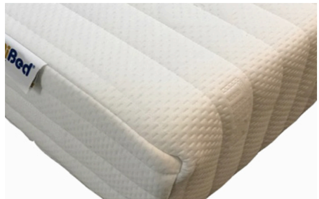
FULLY REVERSIBLE MATTRESS WITH QUILTED STRETCH COVER SAME BOTH SIDES