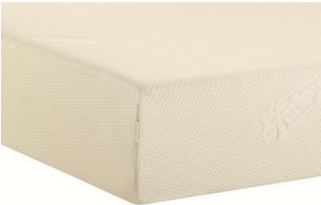
PLAIN STRETCH FABRIC WITH ZIP (OFTEN ON UNDERSIDE) WITH PLAIN FABRIC UNDERSIDE - SITS FLAT ON BASE